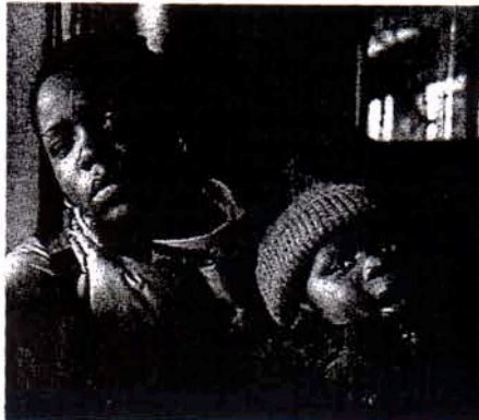
Film Society of Lincoln Center