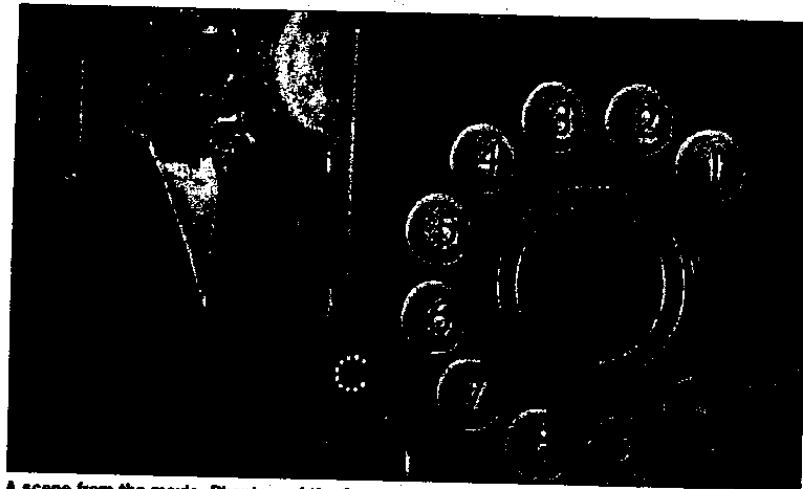
A scene from the movie, Phantom of the Operator , shows at 12:30 p.m. today.

Although the images all arise from hundreds of industrial education films of the last century, Caroline Martel's spellbinding film feels more like science fiction than documentary ... but it's science fiction in the past tense, recasting the utopian industrial fantasies of yesteryear into ghostly emanations from another world. Narrated — although that word doesn't do justice to her performance — by Pascale Montpetit, Phantom of the Operator chronicles developments in telecommunications from the phone companies' training and recruitment films, when the feminine "voice with a smile" vouched progress with a human face.