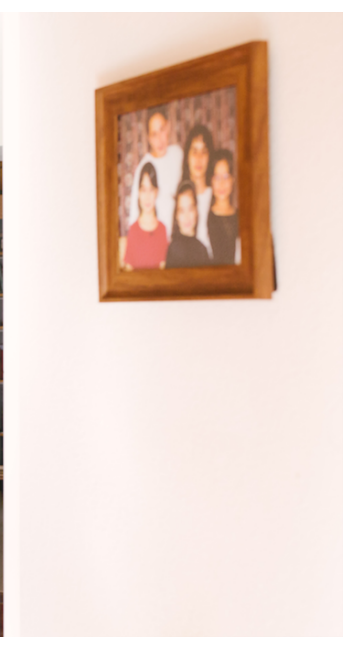
72 Minutes, HD